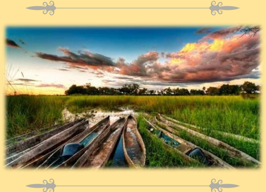
Day 1 – we will meet you at Maun Airport, introduce you to your pilot and fly for 25 min to Oddballs Camp.