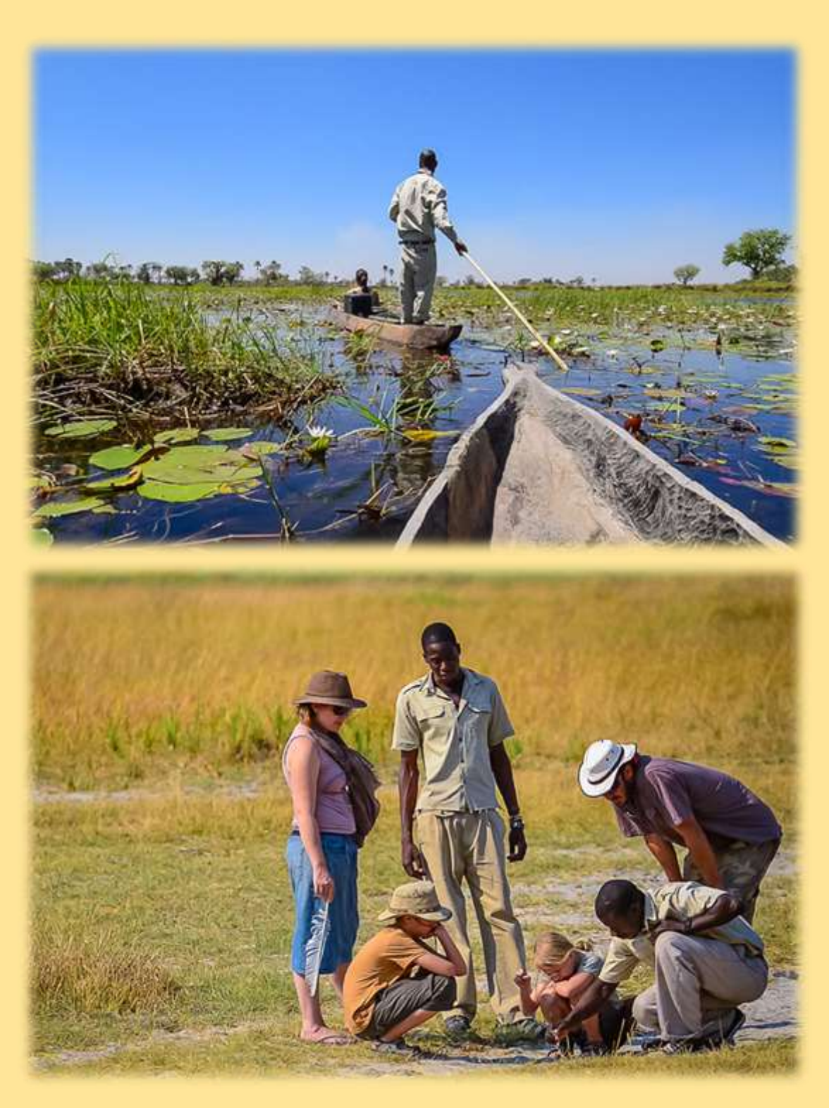
Oddballs' Camp Game Viewing and Activities

Oddballs' Camp is situated within a diverse habitat that includes an incredible variety of animals. Bird watching is excellent year-round, while the lagoons are home to bream, catfish and the feisty Tiger fish. Otters, honey-badgers, the shy pangolin, and a variety of the smaller wild cats such as civets, servals and genets are also seen on occasion in the Delta. Activities focus on offering guests a water-based experience and led by professional and knowledgeable guides who will accompany guests on all game activities. Activities are conducted by your own professional guide (a maximum